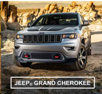
JEEP® GRAND CHEROKEE